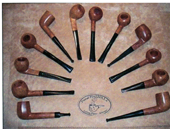
Medium pipes, premier quality, natural colouration: 144€ per dozen