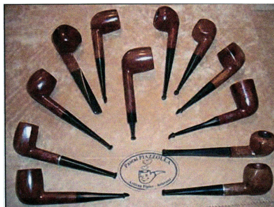
Medium pipes, coffee colour: 120€ per dozen